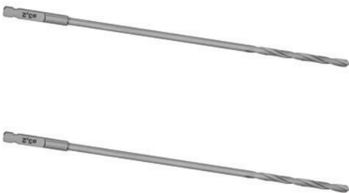
2 x Drill Bits QC, 3.2mm Diameter, 145mm Length